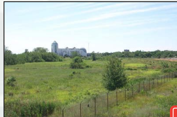
Liberty State Park, Jersey City