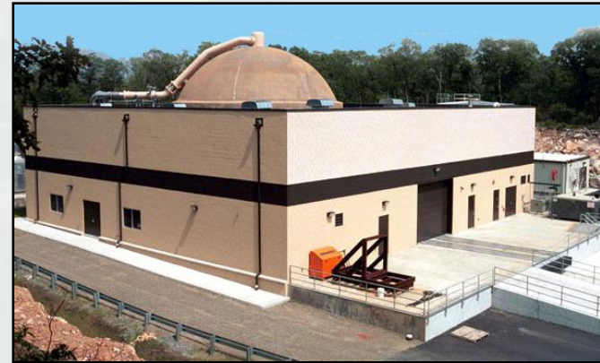
High Explosives Research and Loading Facility