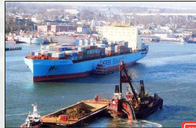
Navigation dredging in the Port of NY and NJ