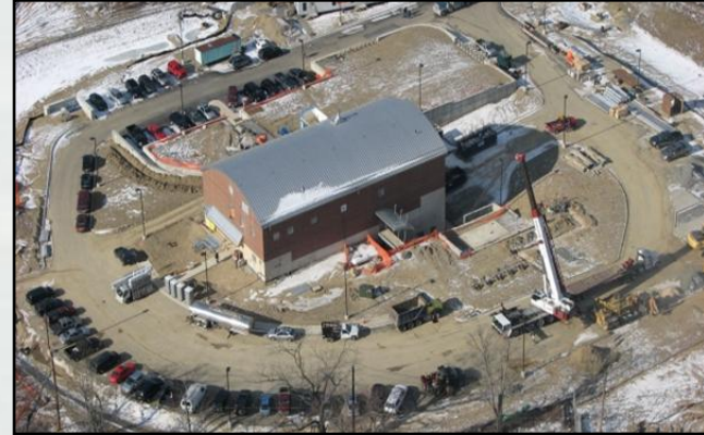
Security upgrades at an upstate water source