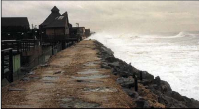
Monmouth Beach in New Jersey