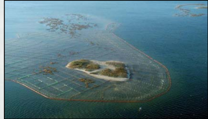
Restoration work in Jamaica Bay, NY