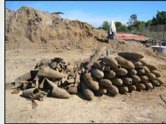
The former Raritan Arsenal in Edison, NJ