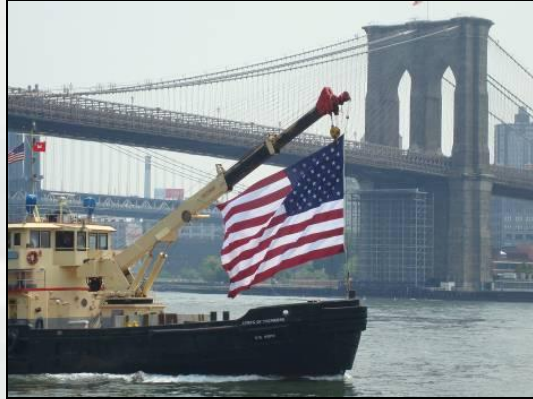
Hazard mitigation work - (Security Upgrades)