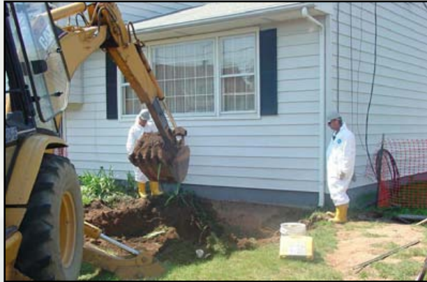
Federal Creosote site in Manville, NJ