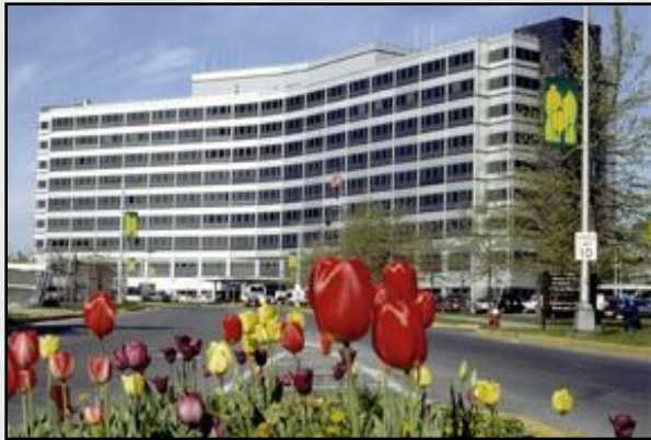
Bronx Veterans Administration Hospital