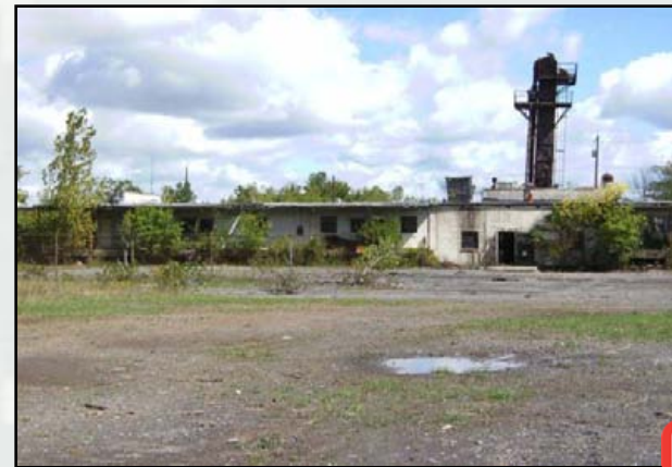
Seneca Army Depot in upstate NY