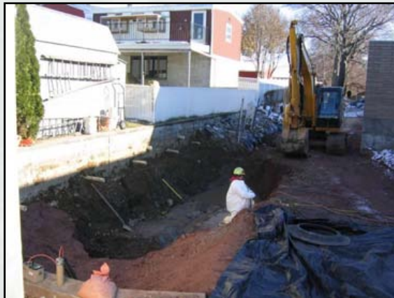
Ongoing FUSRAP work in Maywood, NJ