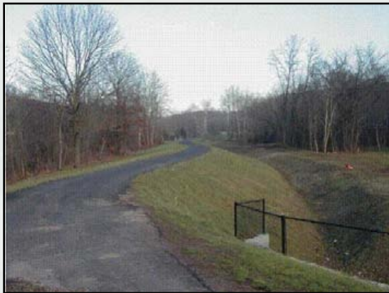
Levee that is part of the Green Brook flood damage reduction system being constructed in NJ