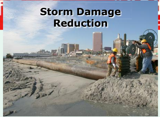
Storm Damage Reduction