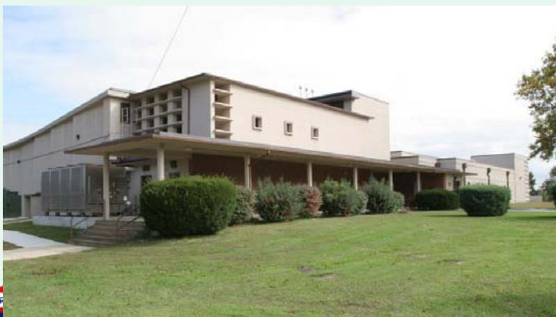
Fort Dix, NJ