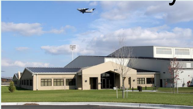
Dover Air Force Base, DE