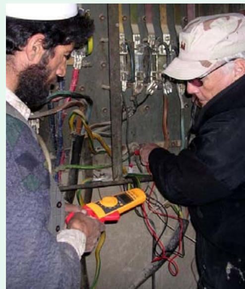
Afghanistan & Iraq