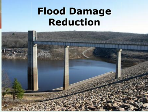
Flood Damage Reduction