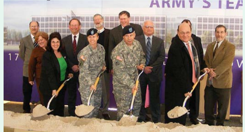
Aberdeen Proving Ground, MD