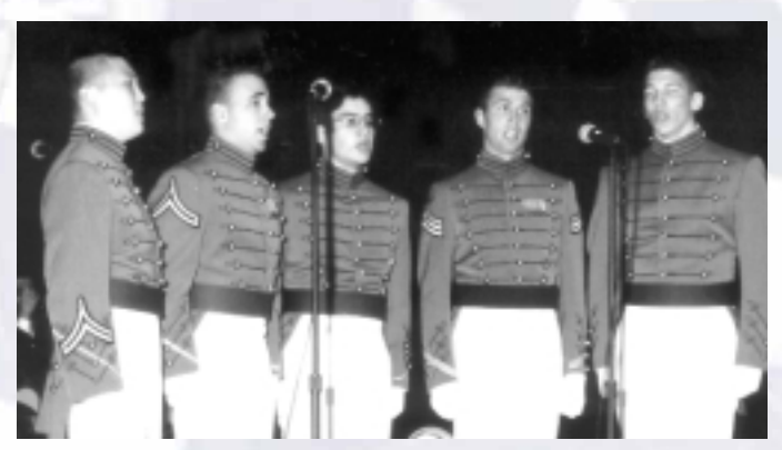
MEMBERS OF THE WEST POINT GLEE CLUB