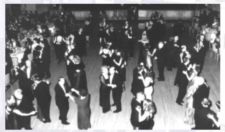
GRAND BALLROOM, WALDORF-ASTORIA—NOVEMBER 4, 2000