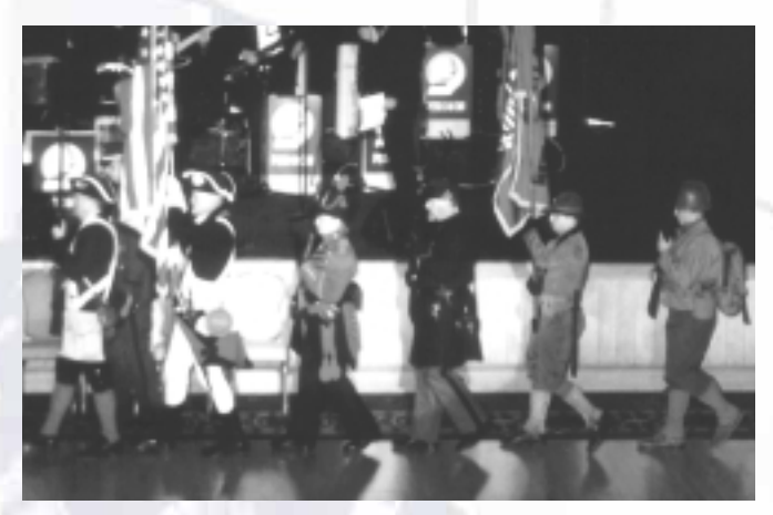
THE COLOR GUARD