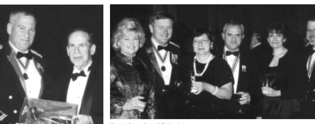
Honored guests and their wives